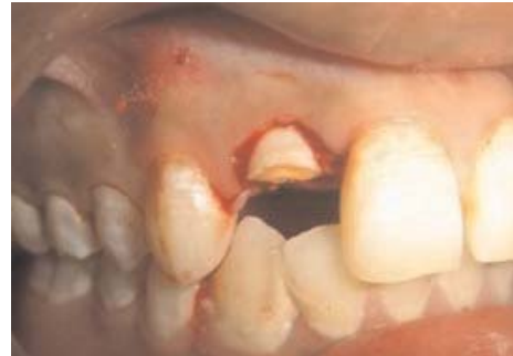
Fig. 5. Use of electro-surgery electrode for gingivectomy