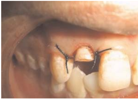
Fig. 8. Coe-pak applied to the operated area