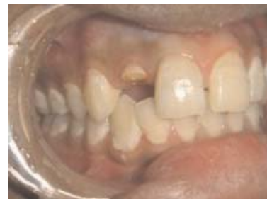
Fig. 3: A primary incision made against the alveolar crest using #15 blade along the gingival surface